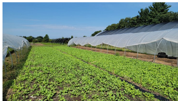
Fall cover crops on a small farm