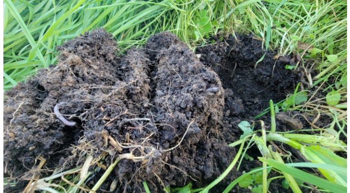
Cover crops increase soil health