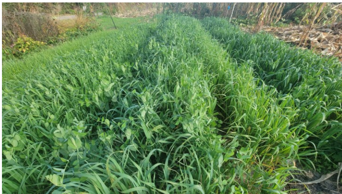
Oats and field peas