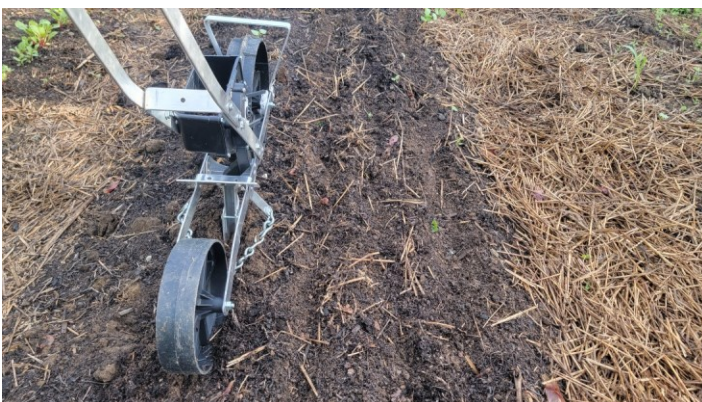
Seeding cover crops with a row seeder

Living cover crops improve soil health, but in most cases, they need to be terminated before planting