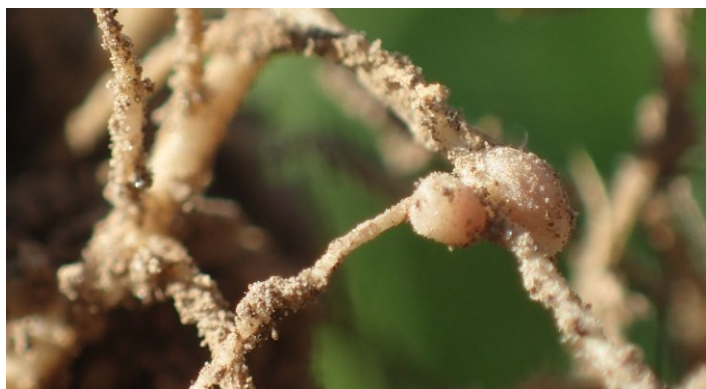
Nitrogen fixing bacteria nodes on legume root

Increased soil organic matter and improved soil structure will result in enhanced water infiltration and water holding capacity. As soil health improves, the soil develops a better relationship with water. The soil will have an increased capacity to retain moisture in droughts and regulate water in intensive rainfalls. In areas with limited soil moisture, a cover crop can be terminated sufficiently early to conserve soil moisture for the subsequent crop. If a cover crop matures in a dry season and utilizes soil moisture reserves, be prepared to irrigate. Cover crops established for moisture conservation should be left on the soil surface after termination. In areas with potential excess soil moisture, a cover crop can be allowed to grow as long as possible to maximize soil moisture removal.