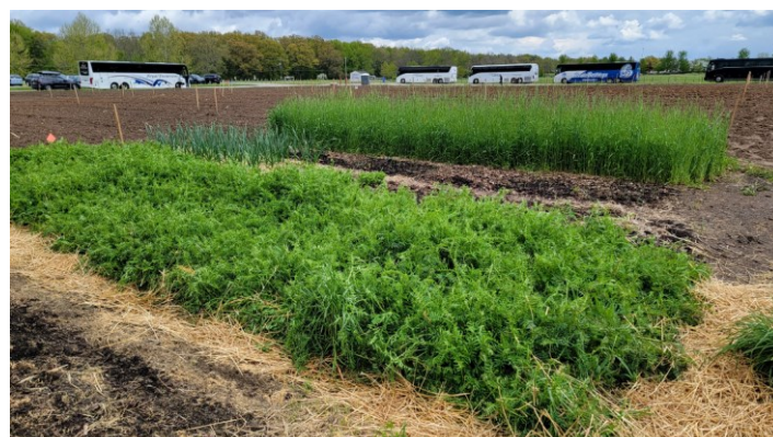
Cover crops at a garden