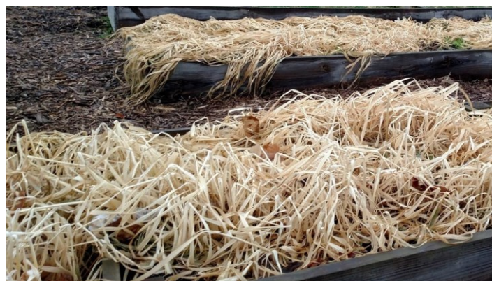
Winterkilled oats cover crop

Legume cover crops can typically produce most or all of subsequent crop nitrogen needs. Many legumes require Rhizobium Bacteria to fix nitrogen. In many cases these are specific strains to individual species