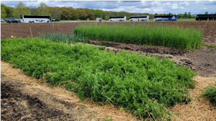
Cover crops in a garden

Cover crops reduce soil erosion in several ways. They protect the soil surface from raindrop or irrigation water impact, increase water infiltration, secure crop residues and compost applications, improve soil aggregate stability and provide a network of roots which protect soil from flowing water.