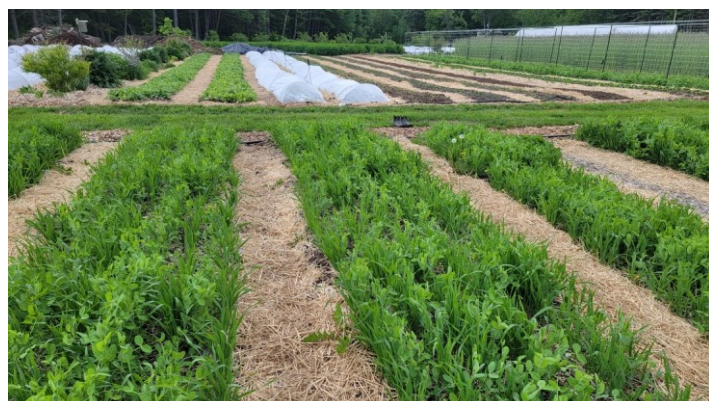
Spring cover crops on a small farm