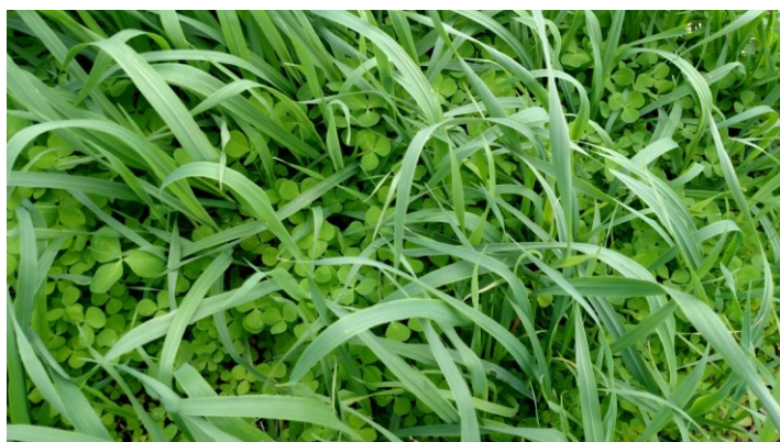
Oats and crimson clover