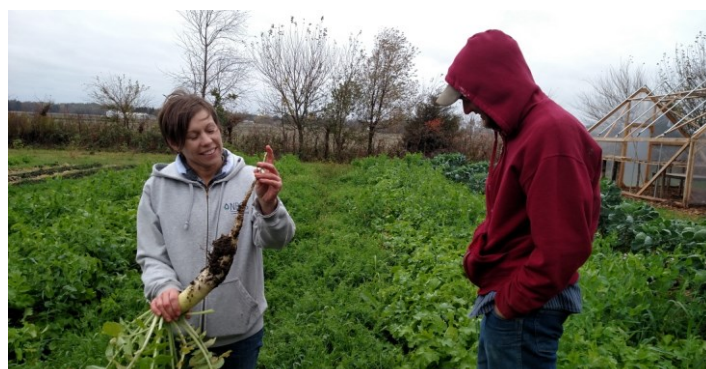
Oilseed radish breaks up compaction

It is very important to plant cover crops into a weed