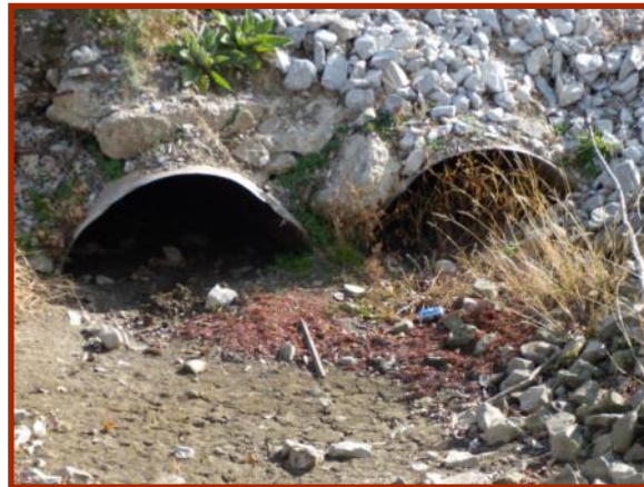
Sediment clogs drainageways, pollutes surface water and is detrimental to wildlife.

The public can help us by letting us know when they see off site erosion problems such as a lot of sediment being tracked onto the public roads or sediment washing into ditches or streams. Catching these problems early can help minimize the most prevalent pollutant problem in Indiana's surface waters by volume.