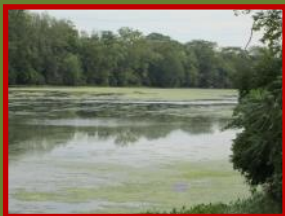
Pond weeds & algae blooms—common summer pond problems

Check our Blog for current topics and SWCD activities: