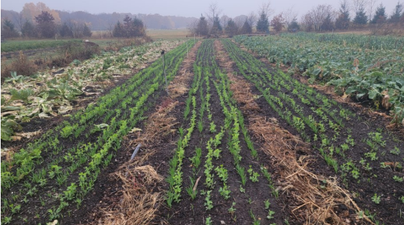
Oats and peas planted with row seeder