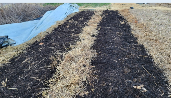
Oat mulch raked into pathways + compost