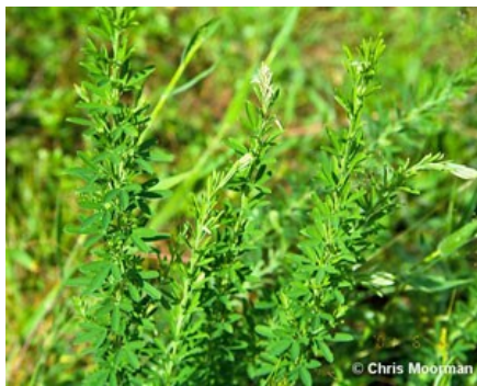
Chris Moorman—North Carolina State

Sericea grows in places where other plants cannot. It fixes nitrogen, so it can survive in poor soils. Although introduced from Asia in hopes of providing food for wildlife, sericea lespedeza is unpalatable compared to native species because of the high concentration of tannins in its tissues. Sericea has a deep taproot allowing it to outcompete native plants for water and nutrients. It drops 1,000 or more seeds from each stem, and these can remain viable for over twenty years. It is a perennial and takes on a woody appearance. Very difficult to control. The best control appears to be the use of a herbicide containing triclopyr as the active ingredient, but since seed may remain viable in the soil for years, control is a long and continuous process.