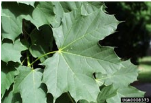
University of Georgia

A native of central Europe, Norway maple has escaped cultivation and forms monotypic populations by displacing native trees, shrubs, and herbaceous understory plants. Once established, it creates a canopy of dense shade that prevents regeneration of native seedlings. It is considered one of Indiana's unwanted invasive plants. Do not plant this tree. The purple leafed maple is also a variety of Norway Maple. Its shallow root system dries out topsoil and prevents grass and other plants from growing under the tree. It is considered to be highly invasive because of its heavy seed production. The best control measure is pulling seedling and the cut stump method and application of a systemic herbicide containing at least a 30% concentration of glyphosate or triclopyr active ingredient.