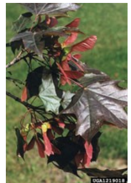
University of Georgia