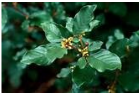
Blooming Plant ForestThreats.org

Glossy buckthorn is native to North Africa, Asia and Europe. It was introduced to North America as ornamental shrubs for fence rows and wildlife habitat and is still used in landscaping. Glossy buckthorn is highly invasive and has a wide habitat tolerance, a rapid growth rate and an extensive root system. It produces abundant flowers and fruits throughout the growing season. Seeds are widely dispersed by birds. This shrub aggressively invades natural areas and forms dense thickets eliminating native species. They leaf out very early in the growing season and keep their leaves late into the fall helping to shade out native trees, shrubs and wildflowers. Seedlings can be controlled by mowing, hand pulling or grubbing. Larger plants are best controlled by cutting and treating the stumps with a systemic herbicide.