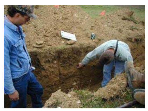
A thorough understanding the characteristics and limitations of our soil types is a vital role that the SWCD plays as an adviser for natural resource decisions.