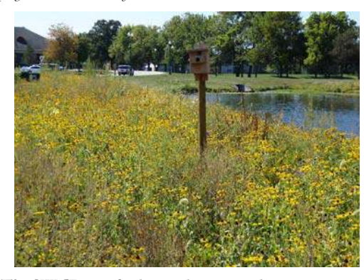
The SWCD is a leader in educating and promoting development techniques and innovations that improve and protect natural resources.