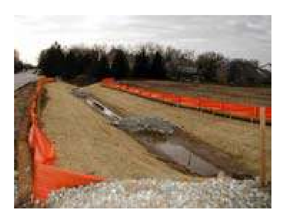
Controlling erosion is one of the SWCD's primary responsibilities.

The SWCD also has a focus on the natural resource most often neglected – the soil. Soil is not only a vital resource for its ability to sustain life but controlling soil erosion is crucial to protecting water quality and protecting landowners from drainage and flooding problems. Through technical and educational assistance, erosion control monitoring and available cost-share