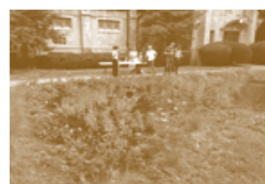
Fall Creek Partnership - Conservation Practices Improve Water Quality