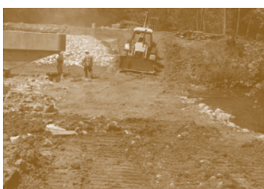
Construction Site Reviews & Inspections Help Prevent Pollution