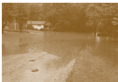
Assisting Residents with Flooding Issues

This 2013 annual report was developed to keep city, county, and federal level legislators, government agency directors, and various community leaders informed of our on-going activities. This is just a snapshot of our activities, anyone with any questions or comments are encouraged to contact our Marion Co. SWCD office at Discovery Hall, Suite 200, 1202 E. 38th St., Indianapolis, IN 46205 for more details. Our phone number is 317-786-1776, and our web site is www.marionswcd.org