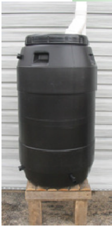
Black or Gray